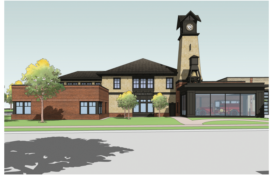
Architect rendering of the new City Hall. The clock tower is nearly 24 feet tall (57 feet from ground level) and weighs about 4600 pounds and the bell tower rises just over 14 feet (30 feet from ground) and weighs about 4100 pounds. RENDERING BY ENVIRONMENT ARCHITECT.

guess is around 11:30 to Noon). - The bell tower structure will be "picked" next.