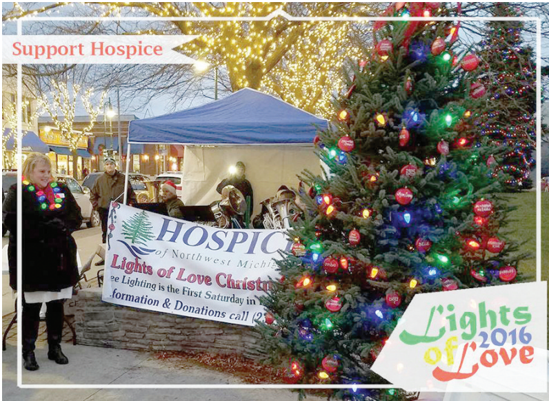
Charlevoix Lights of Love event.

pital of Northwest Michigan would like to thank all the people and families who sponsored lights and purchased ornaments and hearts. We could not have done it without the local businesses and merchants who sponsored the event and made donations to make this a very special event. Again a huge Thank you to: