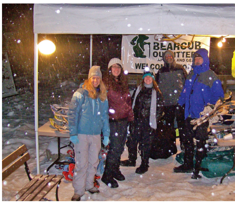
On January 28 and February 25, experience the ambiance of snow-covered trails illuminated by more than 100 torches on your trek at Camp Daggett.

Camp Daggett offers great activities for families this winter. On January 28 and February 25 from 5 until 9pm, it's the ever-popular Bearcub Outfitters Torchlight Snowshoe Demo. Experience the ambiance of snow-covered trails illuminated by more than 100 torches on your trek.