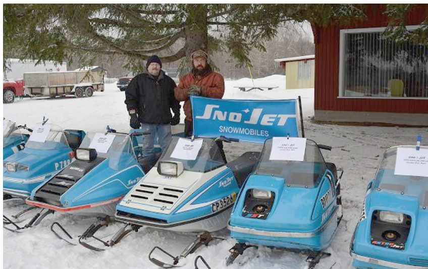
Vintage snowmobiles will be on display on Saturday at the East Jordan Sno-Mobilers Club House, located on Mt. Bliss Rd.

Fishermen and women, try your luck at the Mid-Winter Classic Fishing Tournament that begins on January 20 at 7am and goes until January 22 at noon. There will be cash awards