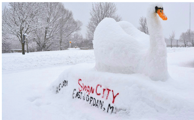
Beautiful snow sculptures around town are a tradition at the East Jordan Sno-Blast.