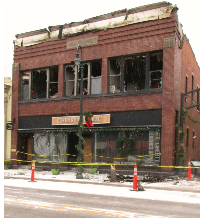
Firefighters were called around 3 a.m. on Christmas Eve to the Van Pelt Building on Bridge Street, where the Cherry Republic store was located, after a Boyne City po-

"The fire was started intentionally or unintentionally in the unlocked shed behind the building," he said, noting that after it started and grew, the flames spread through the first floor window and then into the rest of the building.